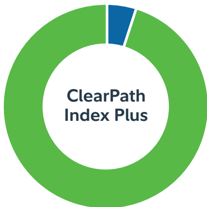
■ Alternative asset classes ■ Public securities